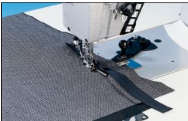
E5 Processing trouser flies: felling the left fly piece (photo) and attaching the right flypiece 上左门襟和右门襟衬里，缝右门襟