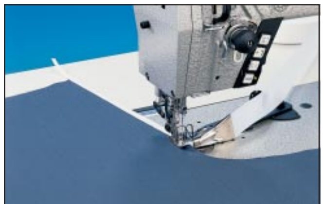
E10 Binding work 包边