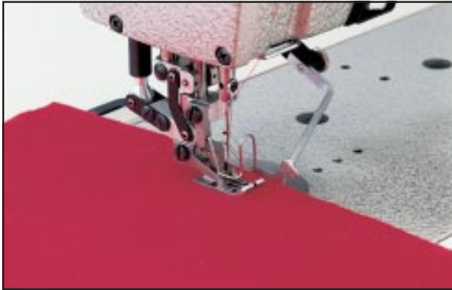
E1 Assembly seams with and without fullness in light and medium-weight material 薄型或中厚料起皱或不起皱的组合缝