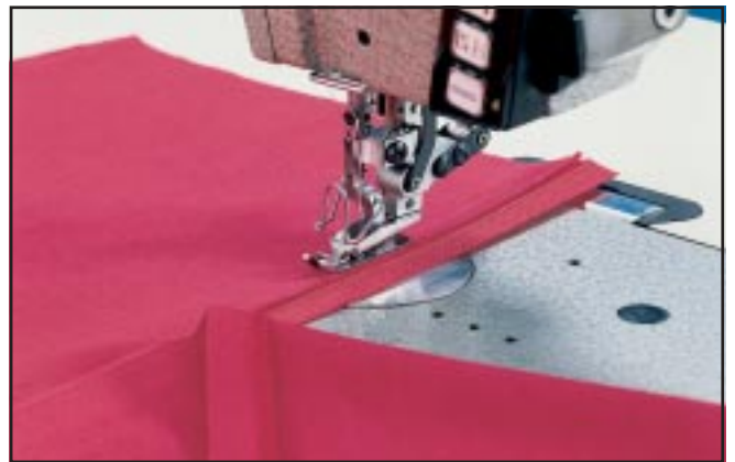
E13 Setting and stitching over zippers 安装拉链，并过线