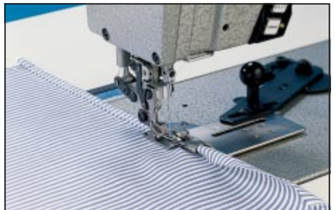
E28 Hemming shirts 衬衫包边