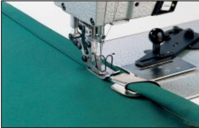
E7 Hemming skirts 预缝及压明线