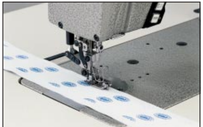
E4 Runstitching collars and cuffs 预缝衣领及克夫