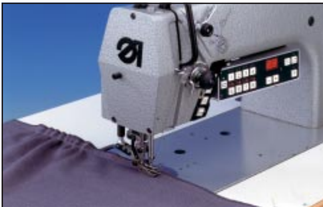
E3 Assembly seams with and without fullness in lightweight and difficult-to-feed material (with or without fullness control) 薄料及不易传送面料的有吃量或无吃量的组合缝(带或不带吃量控制器)