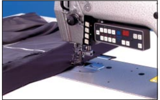
E101 Sewing and simultaneous trimming of fabric edges, E102 e.g. jacket sew and trim front edges E104 缝制和剪边。如：西服门襟缝制和剪边