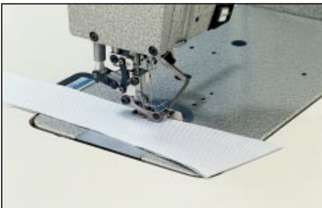
E26 Topstitching collars and cuffs 预缝衣领及袖口