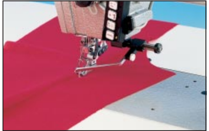
E22 Run- and topstitching with swivable edge guide 预缝及压明线