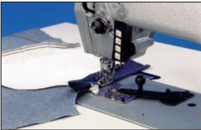
E11 Felling left fly piece of jeans 上牛仔的左门襟